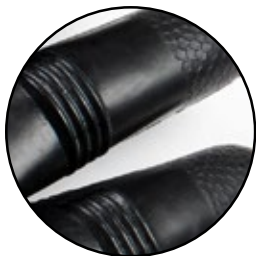
Textured finish for optimized grip

Touchscreen liners provide all the wicking and comfort enhancement of the standard liners but are woven with silver threading to allow for touchscreen use while wearing the AMG.