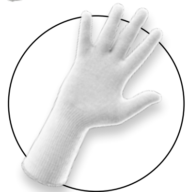
CoolMax removable inner liners