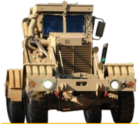
HUSKY 2G VEHICLE

The development of the two-operator Husky 2G clearance vehicle was prompted by the operational requirement for longer, more complex mounted clearance missions and employment of more sophisticated vehicle payloads. Recognized as one of the U.S. Army's Top Ten Inventions of 2011, the 2G platform addresses evolving explosive threats while applying the operationally proven survivability tenets that have made the Husky family of vehicles the most survivable platforms on the battlefield.